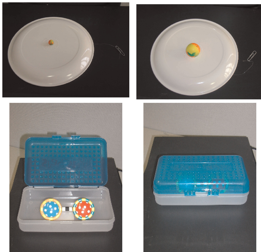
FIGURE 1 Examples of fine motor assessment apparatus, including small pellet, large pellet, and box task.

and percent breastfeeding for the box task. Therefore, poverty and percent breastfeeding were included as covariates only for the box task. A similar statistical procedure was repeated to examine iron status differences in our secondary analyses; sex, age at testing, WAZ, and cultural site were used as covariates based on their relations with the dependent variables. Poverty and percent of infants breastfed were also included as covariates for the box task. All statistical tests were two-sided with the level of significance set at .05. Trends at the .1 level were also considered due to the high variability observed in infancy.