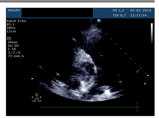
Figure 1. Transthoracic echocardiography showing saddle pulmonary thromboembolus.

or bleeding occurred. At 37 weeks of gestation, 24 hours before an elective caesarean delivery, fondaparinux injections were discontinued. At that time, platelet count was 200\times10^9/L and no signs of right ventricular dysfunction were present on echocardiography. The patient successfully underwent an elective caesarean section under general anesthesia and a healthy female newborn weighting 2620 g was delivered. The course of the surgery was uneventful and no excessive bleeding was observed. Peritoneal drainage and skin closure with interrupted sutures were used as precautionary measures. The newborn suffered from no complications and had a normal platelet count (201 to 313\times10^9 L).